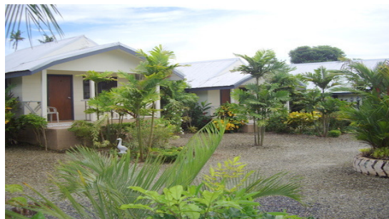
Vaitele Fou Campus

To get started, your son's primary therapist will meet with him to start the first map, to determine the first steps in their journey. During the first week here, time is set aside to begin mapping out the whole journey, and beginning to define what they will need to accomplish in order to graduate from CRA and return to the family.